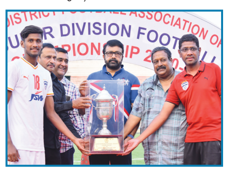
BFC officials receiving the runners-up trophy