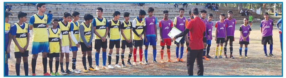
KSFA, BFC trials in Mysore