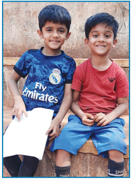
Catch them young ...two Belgavi kids