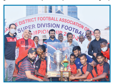
FC Bengaluru United club officials and players receive the winners trophy

"I would also like to thank the KSFA and BDFA for successfully organizing the league in what are undoubtedly unique and challenging circumstances. We had 13 teams participating and the league was extremely competitive, making it a great experience for players and those who watched the games as well!" (BDFA Super Division League points table on Page2)