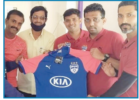
Mandya DFA officials receive a BFC jersey from the BFC coaches