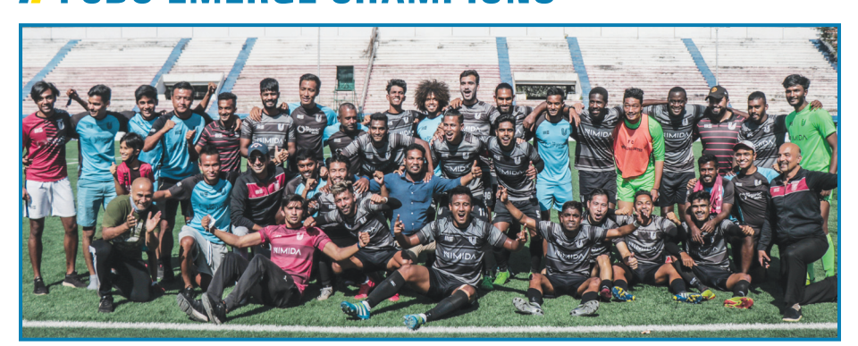
FCBU players and staff celebrate their BDFA Super Division triumph after their final league game

FC Bengaluru United emerged champions in the Citrus Ventures-sponsored BDFA Super Division League 2020-21 title after an intriguing battle for honours.